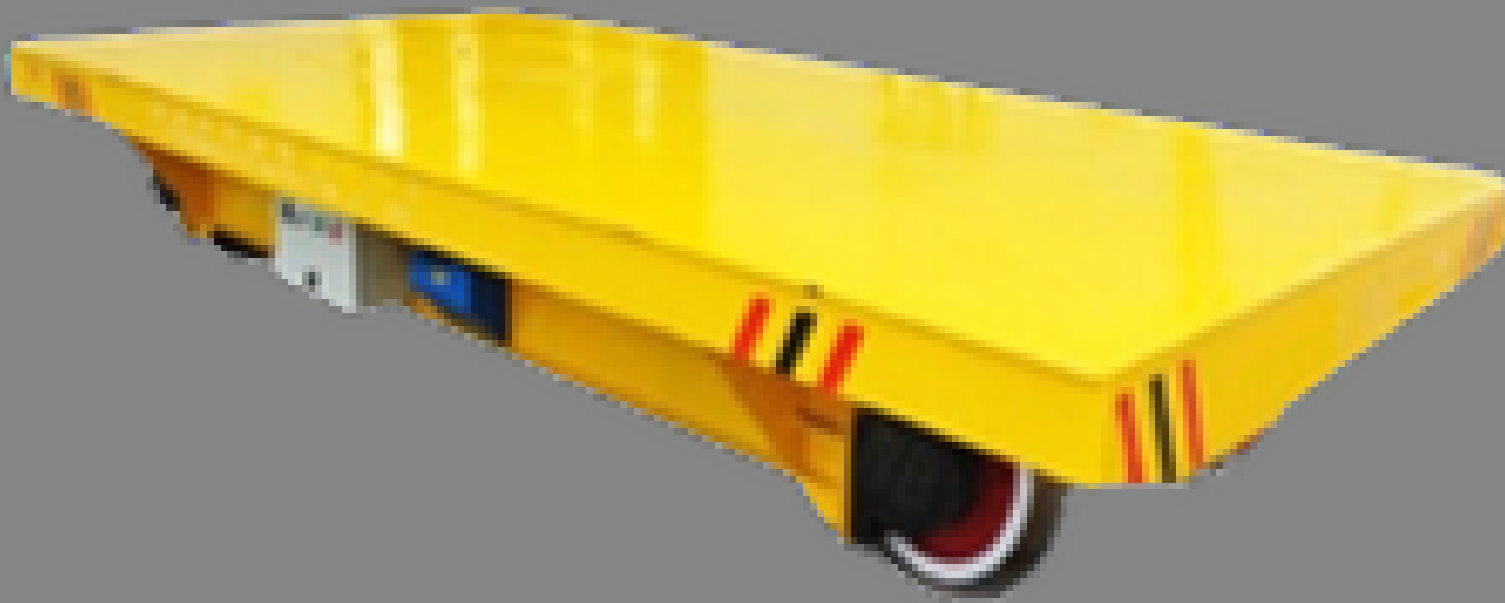
Battery Operated trolley