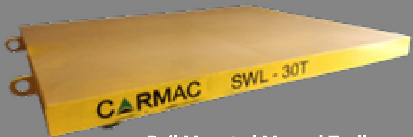
Rail Mounted Manual Trolley